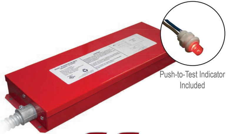
Push-to-Test Indicator Included