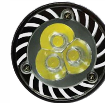
OPTIONAL ALL-LED ILLUMINATION