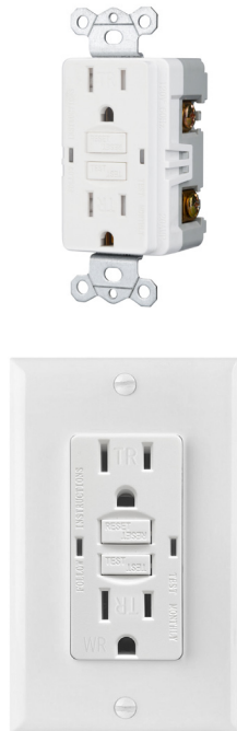
With Wall Plate