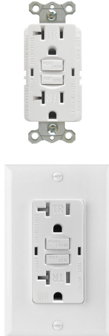
With Wall Plate